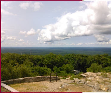
Pictured above is the view captured by a STREAM staff member during our Offsite Trip to Wachusett Mountain this month.

July proved to be a gorgeous summer month, allowing STREAM to partake in multiple outdoor Volunteer & Offsite activities. The Farmers Market began on July 14, 2014 which gave STREAM individuals the chance to sell some of the crafts they have made as well as the vegetables that they helped plant, maintain and pick right here at GAAMHA in our very own STREAM garden. Everyone seems to truly enjoy tending to their garden and harvesting the plants as soon as they are ready. In addition to gardening, July marked the beginning of yet another fun outdoor volunteer opportunity. STREAM has teamed up with Forward Strides Therapeutic Horsemanship in Templeton, a non-profit organization whose mission statement is "To enhance the lives of participants by sharing the positive impact that horses can bring to their lives". Individuals that have attended learned about horses, how to care for them and spent some quality time getting to know the horses!