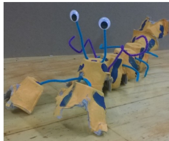
Pictured above is a lobster made by one of our creative individuals here at STREAM. Each member made their very own lobster out of recycled egg cartons and pipe cleaners!

The Annual summer BBQ was held on June 20th. There was a DJ, dancing and plenty of food to go around. Fun was certainly had by all!