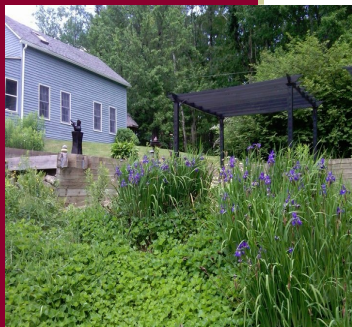
Pictured above is the Memorial Meditation Garden at True North in Hubbardston, MA.

The STREAM program strives to provide our individuals with opportunities to help maximize their capabilities within various aspects of their lives. We have obtained multiple volunteer and offsite activities to help achieve this goal. Some of the places we have visited/ volunteered at are: